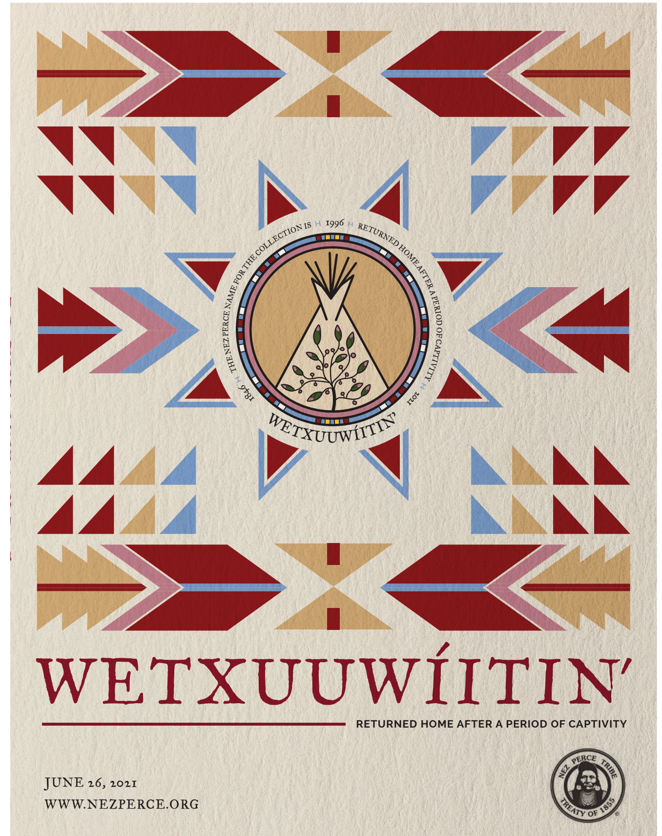
Spalding-Allen Collection Renaming Celebration: Wetxuuiitin' Booklet Design